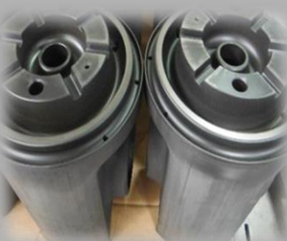
■ PISTON ■