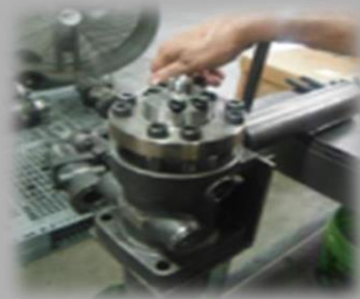
■ FUEL PUMP ■