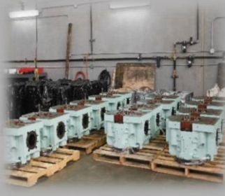
■ CYLINDER HEAD ■