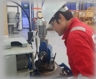
■ VALVE GRINDING ■