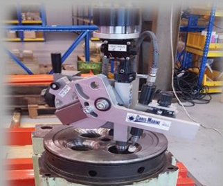
■ SEAT GRINDING ■