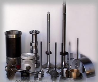
■ SPARE PARTS ■